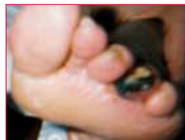
Before endovascular treatment