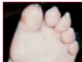
After endovascular treatment